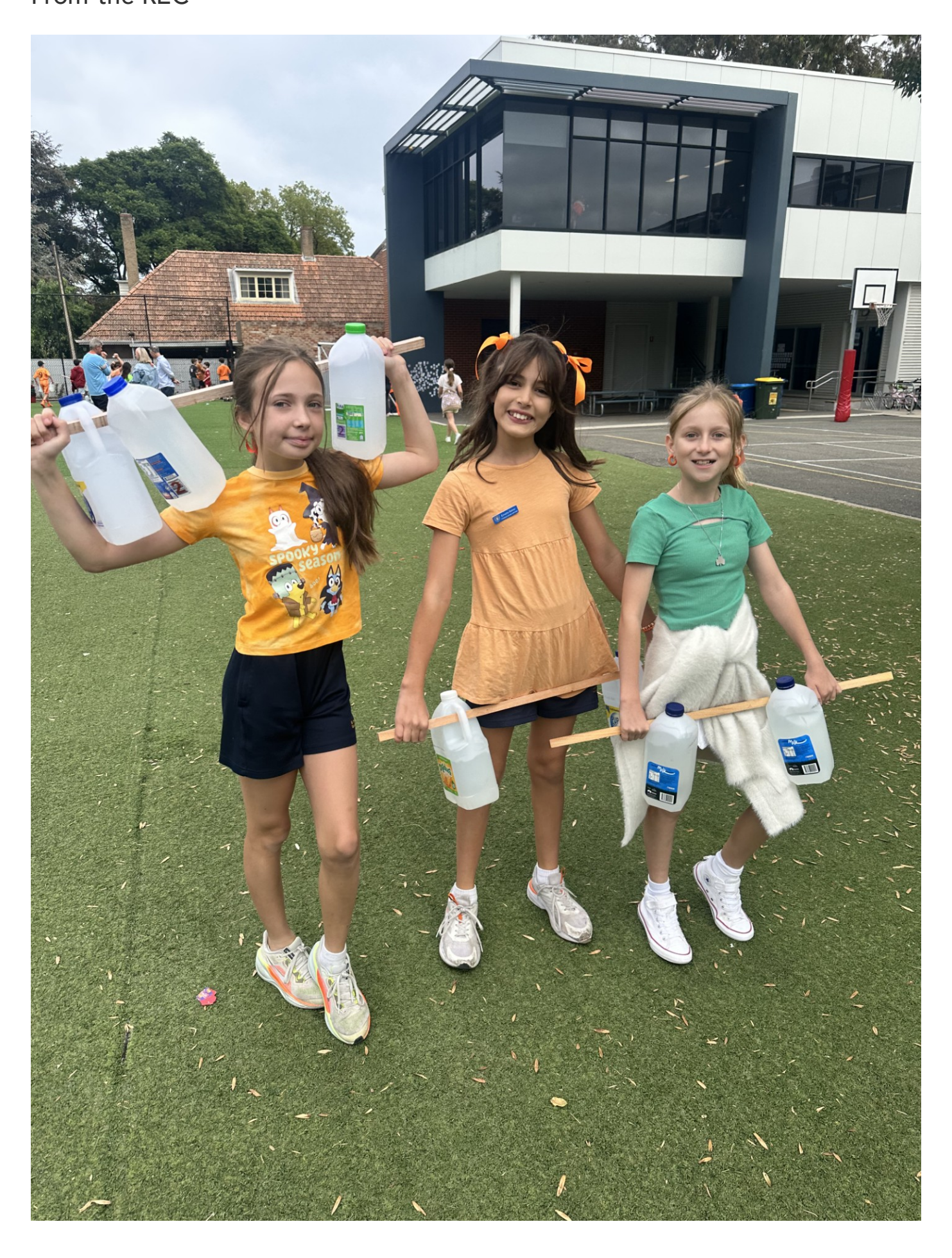
Dear Students and Families,

On behalf of Caritas Australia, I would like to extend our heartfelt thanks to all the students who participated in our Project Compassion