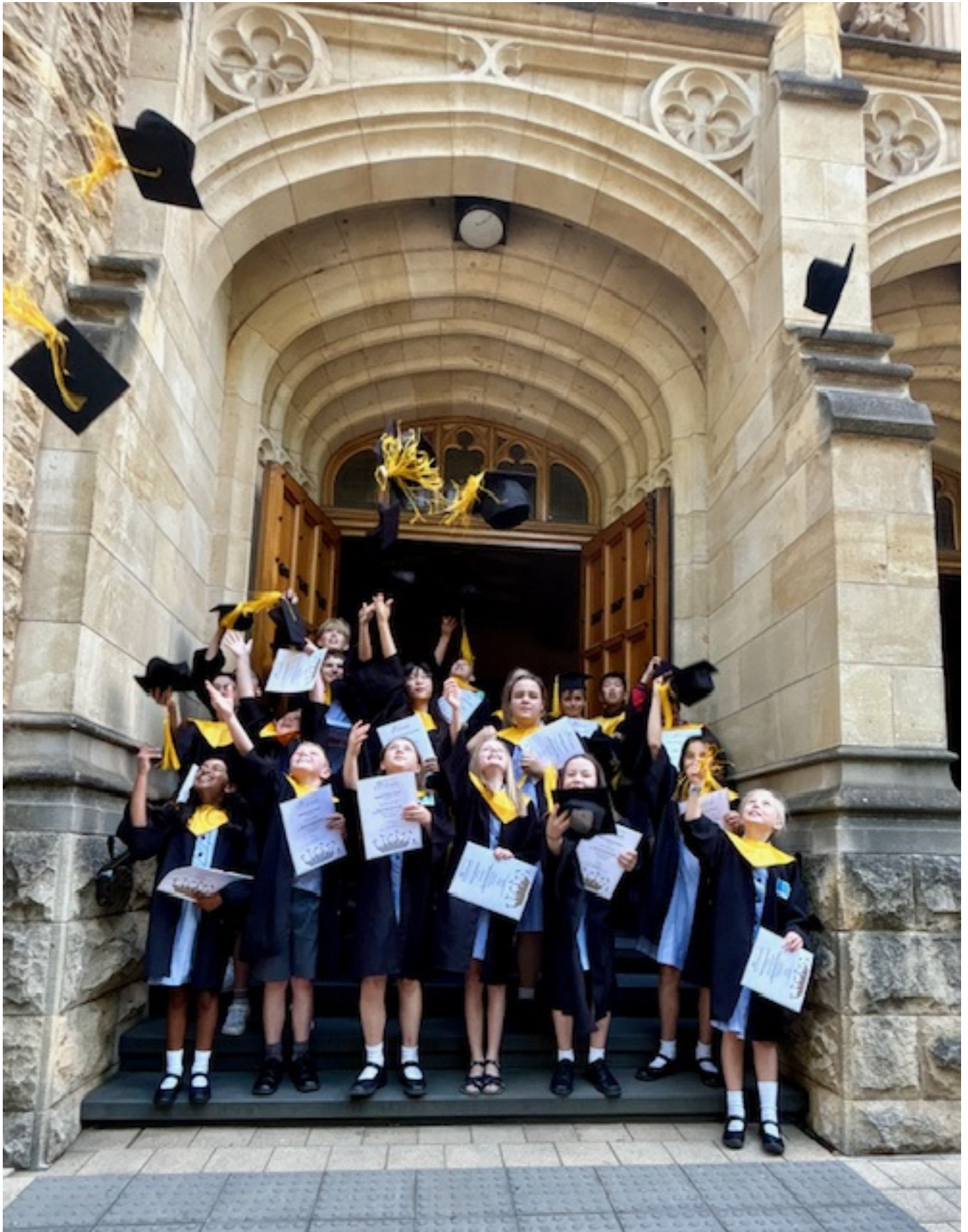
Children's University - Class of 2024!

Our Children's University graduates attended Bonython Hall at Adelaide University on 31st October to celebrate their achievements.